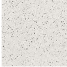
For sample, order BS915 color 00111.