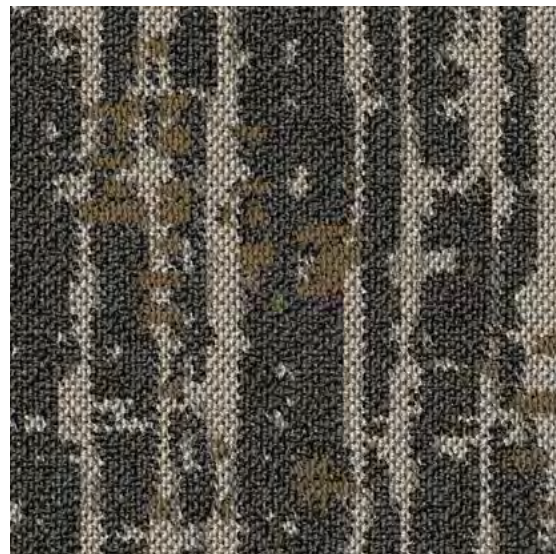
For sample, order BS917 color G4579.