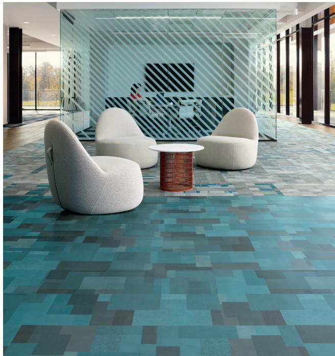
INSPIRE LVT IN TEAL AND ENGAGE TILE IN EXPERIENCE TEAL