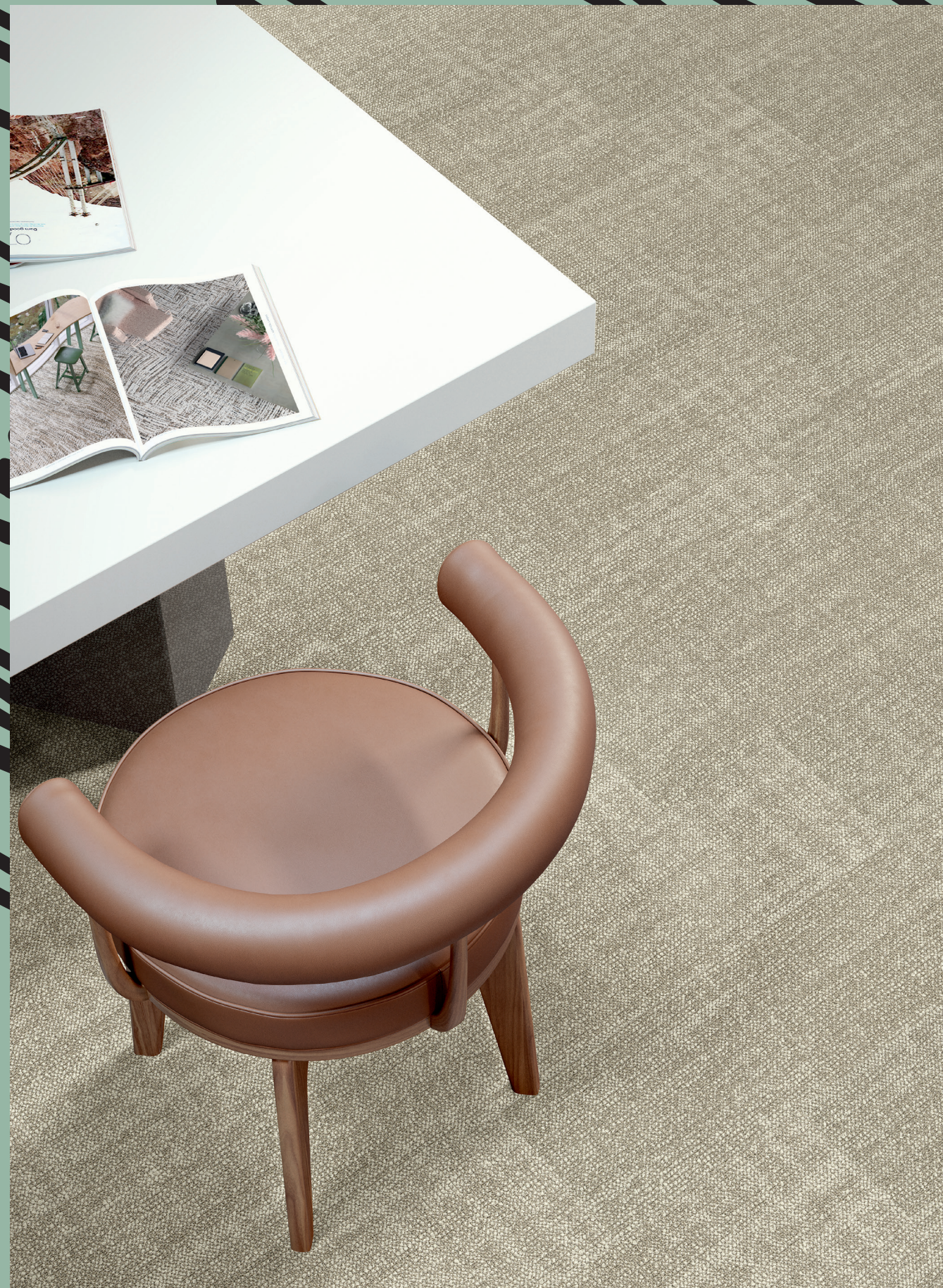
COLLECTIVE V (5T442) IN GREIGE (38105) | INSTALLED STAGGER