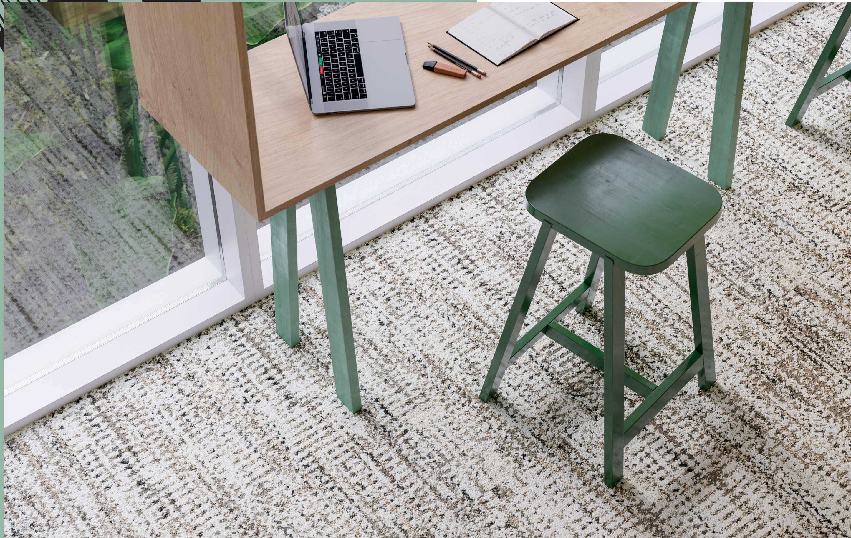
IN COMMON (5T451) IN INCLUDE (50100) | INSTALLED STAGGER