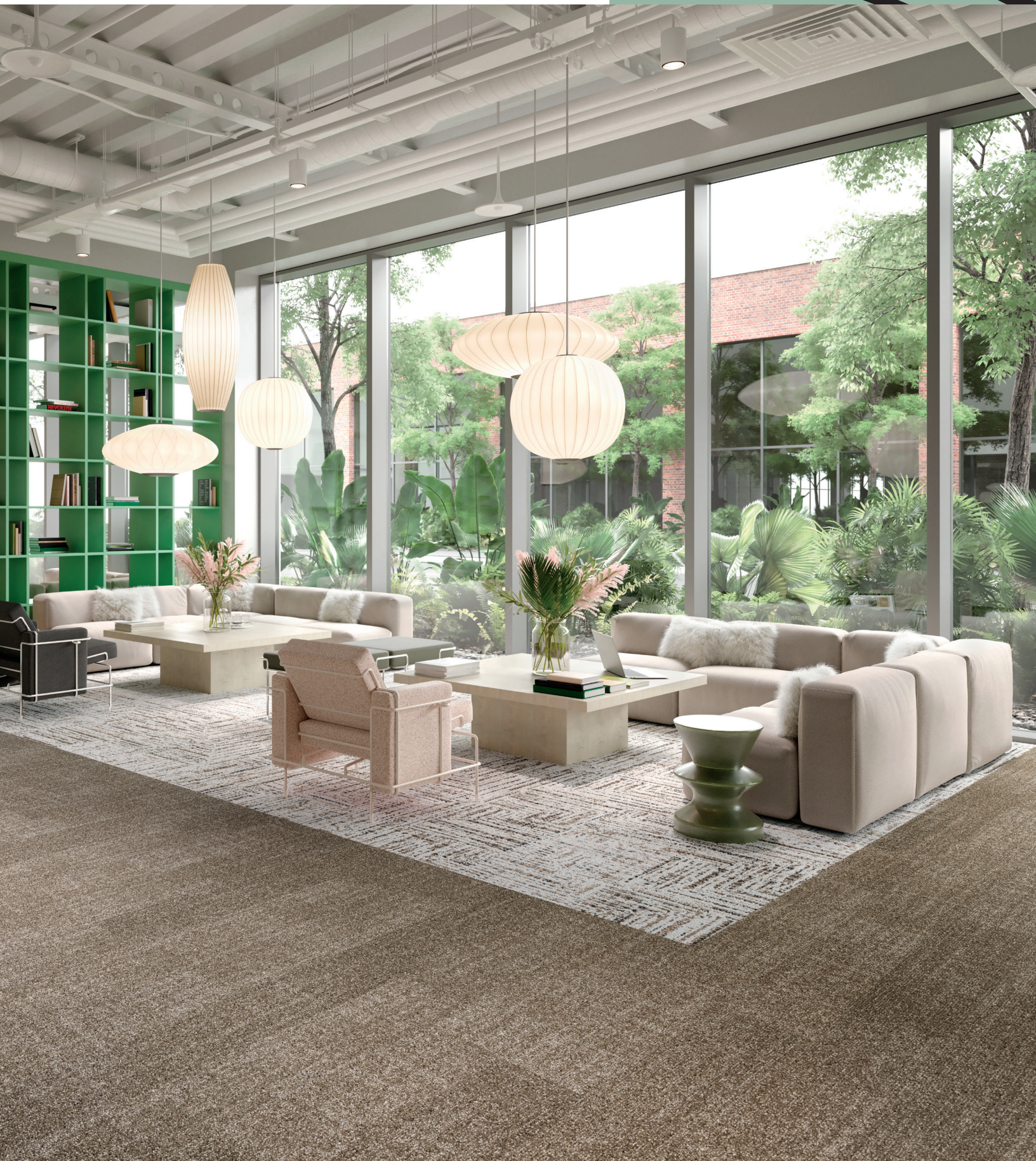
SIDE BY SIDE (5T452) IN INCLUDE (50100) | INSTALLED HERRINGBONE AND COLLECTIVE V (5T442) IN COLOR TAN (38111) | INSTALLED STAGGER