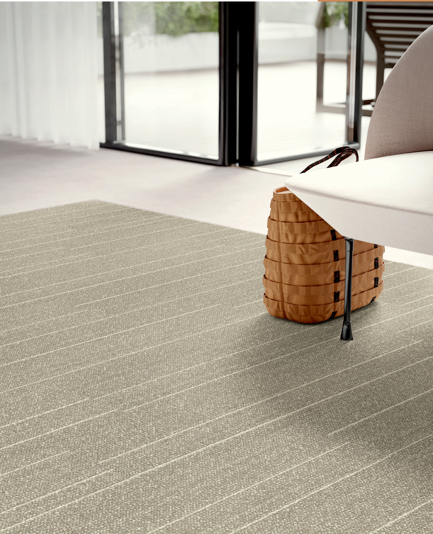
COLLECTIVE III — Pinstripes punctuate this small-scale texture background to add a refined look.