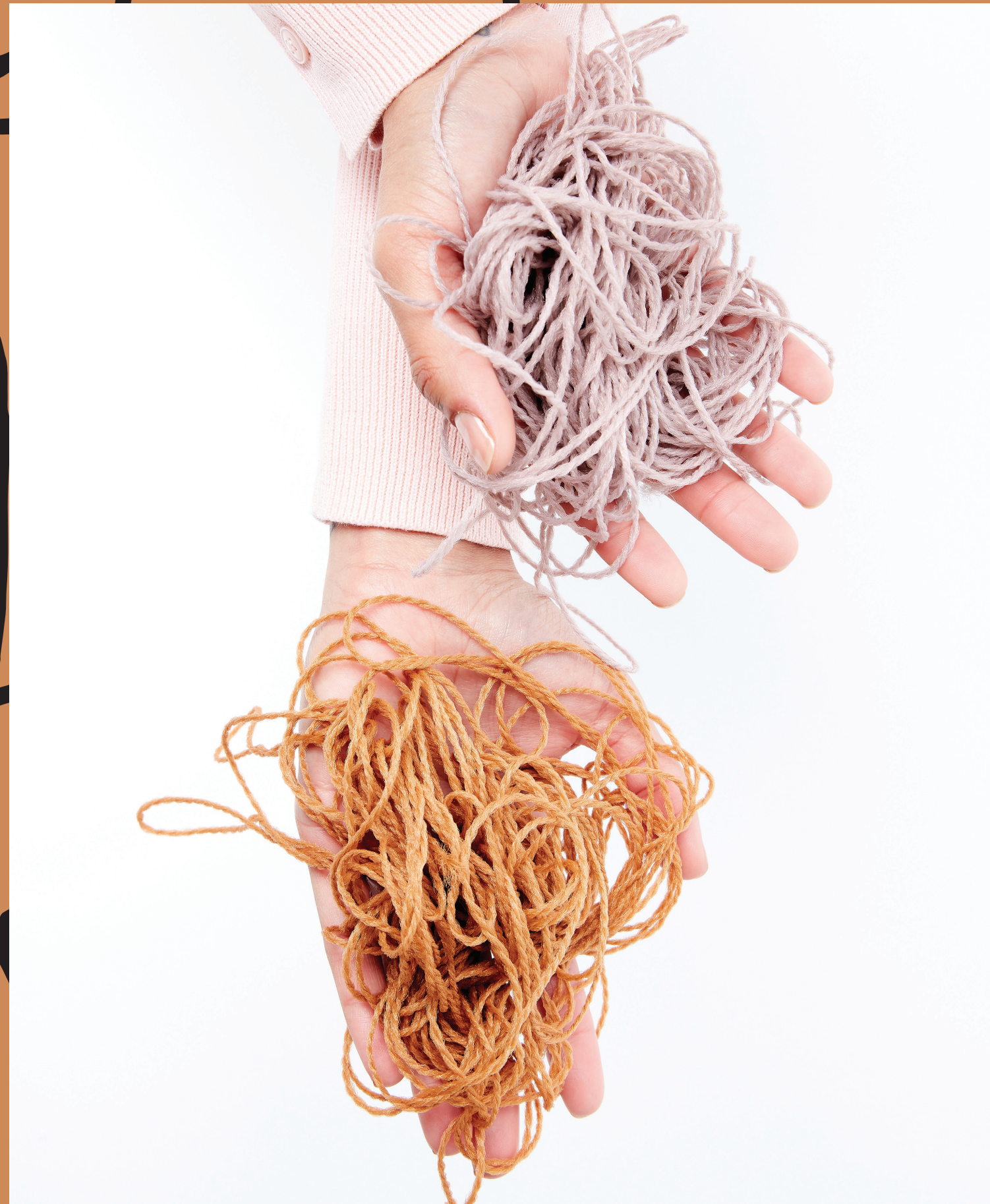
HAND IN HAND — Interlocking lines of abstracted herringbone create impact and dynamic scale.