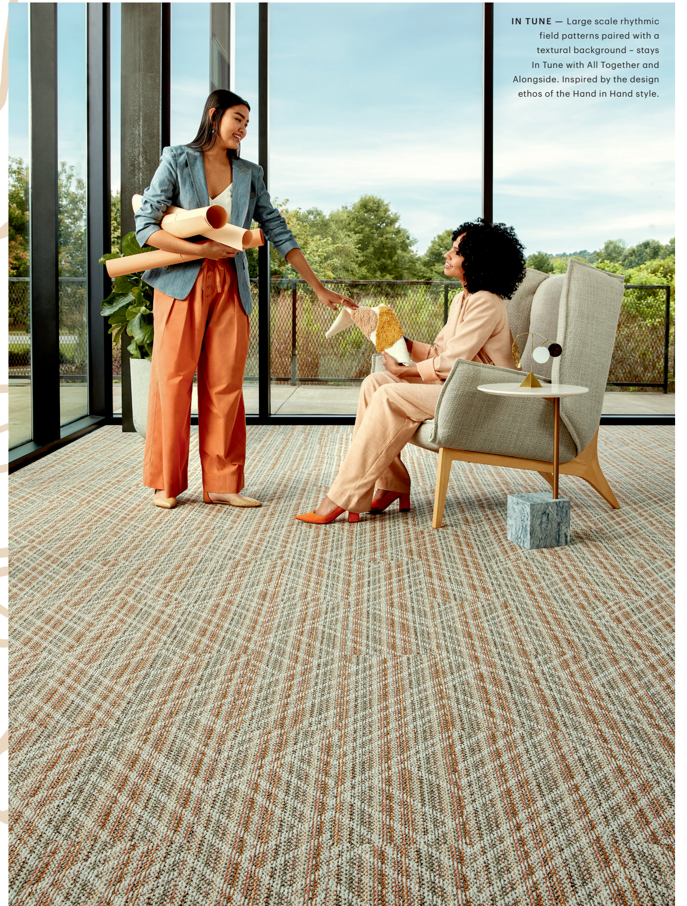
IN TUNE — Large scale rhythmic field patterns paired with a textural background — stays In Tune with All Together and Alongside. Inspired by the design ethos of the Hand in Hand style.