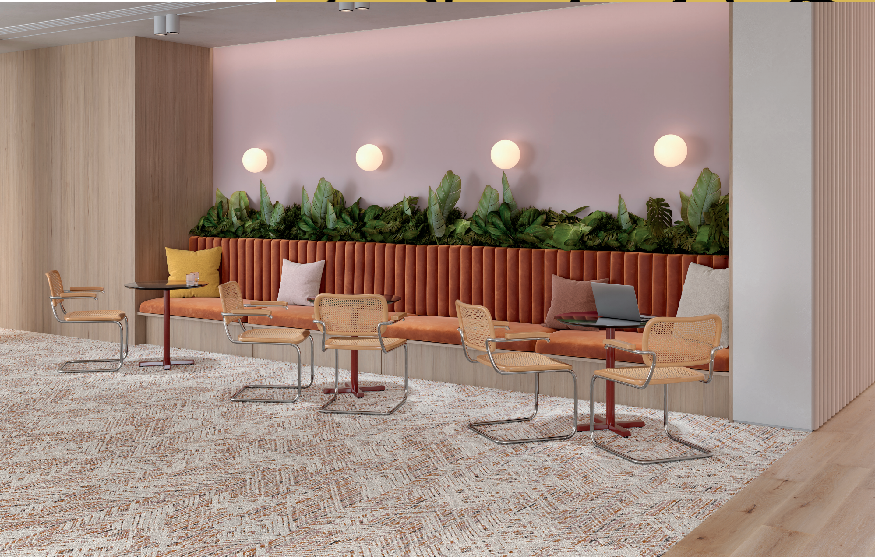
HAND IN HAND (5T450) IN INCLUDE COLOR (50678) | INSTALLED STAGGER AND INLET (0926V) IN SPINDLE (26140) | INSTALLED STAGGER