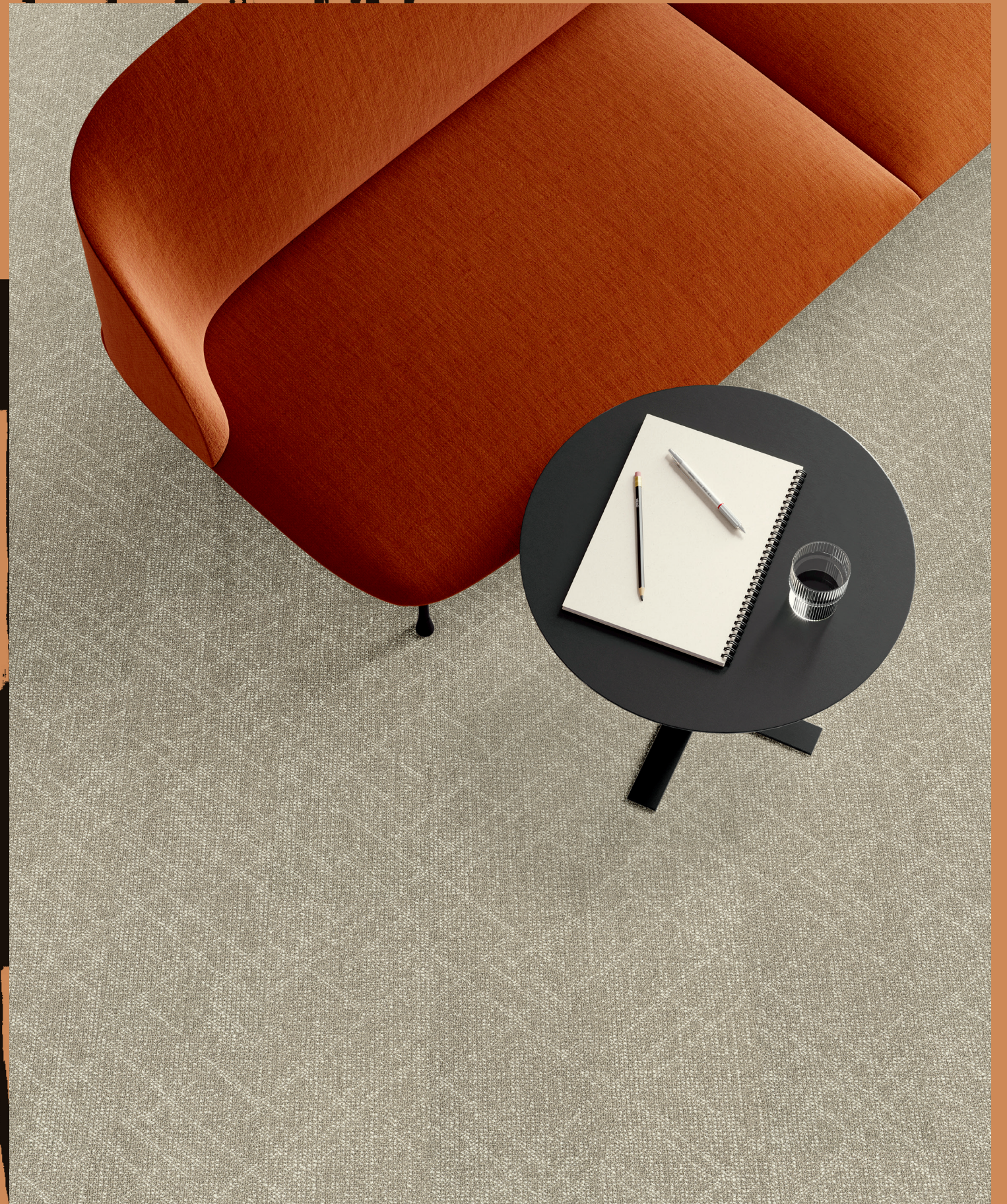
COLLECTIVE IV — Concentrated cross hatching draws focus with expansive areas of openness in this multi-directional pattern.