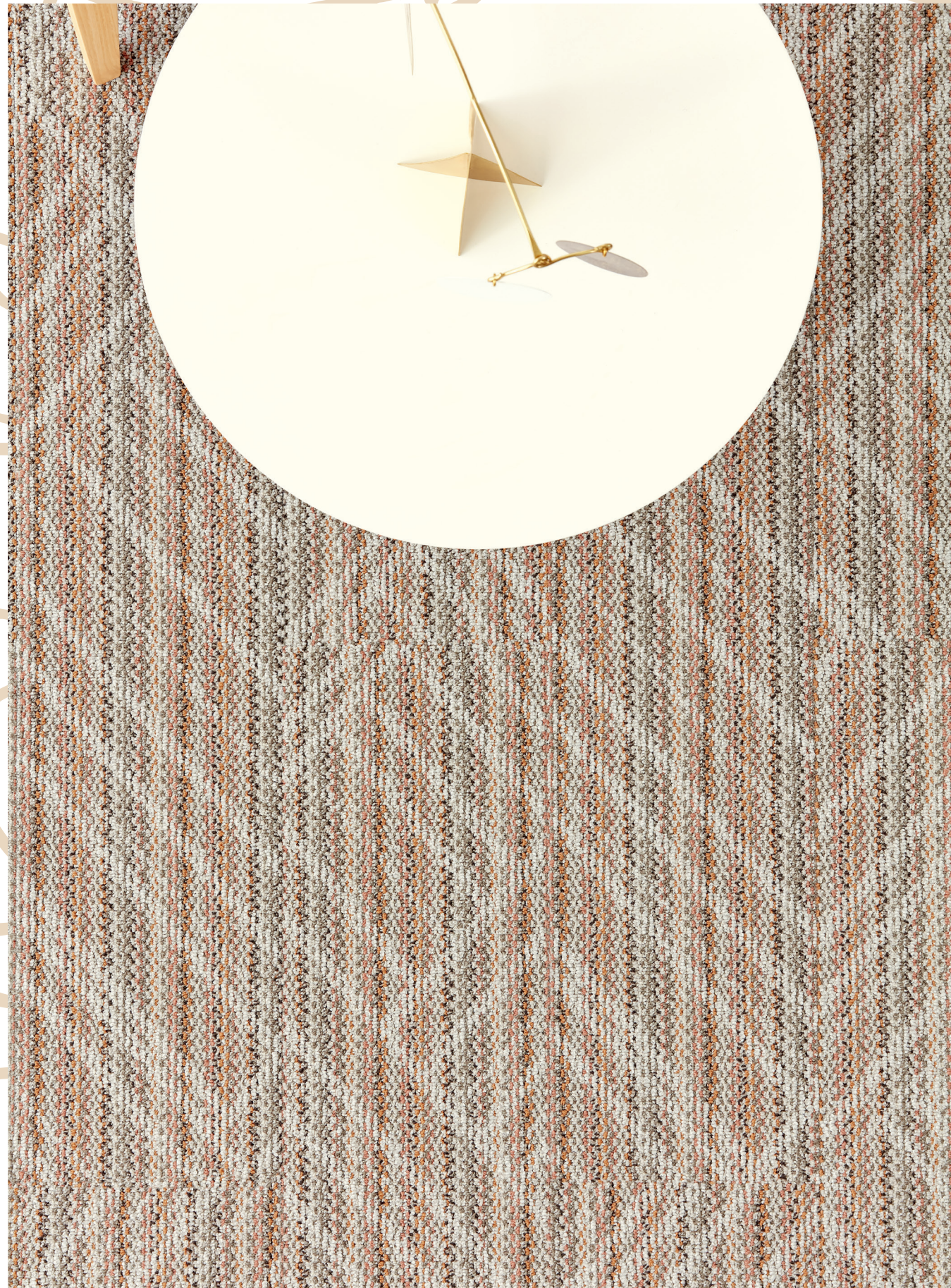
IN TUNE (CARPET TILE 5T496) IN INCLUDE COLOR (50678) | INSTALLED ASHLAR