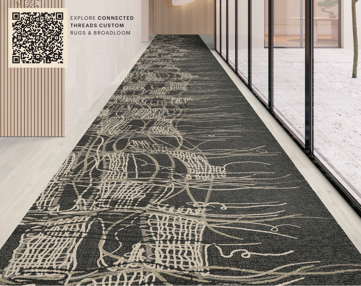
CN86120 CUSTOM CORRIDOR

EXPLORE CONNECTED THREADS CUSTOM RUGS & BROADLOOM