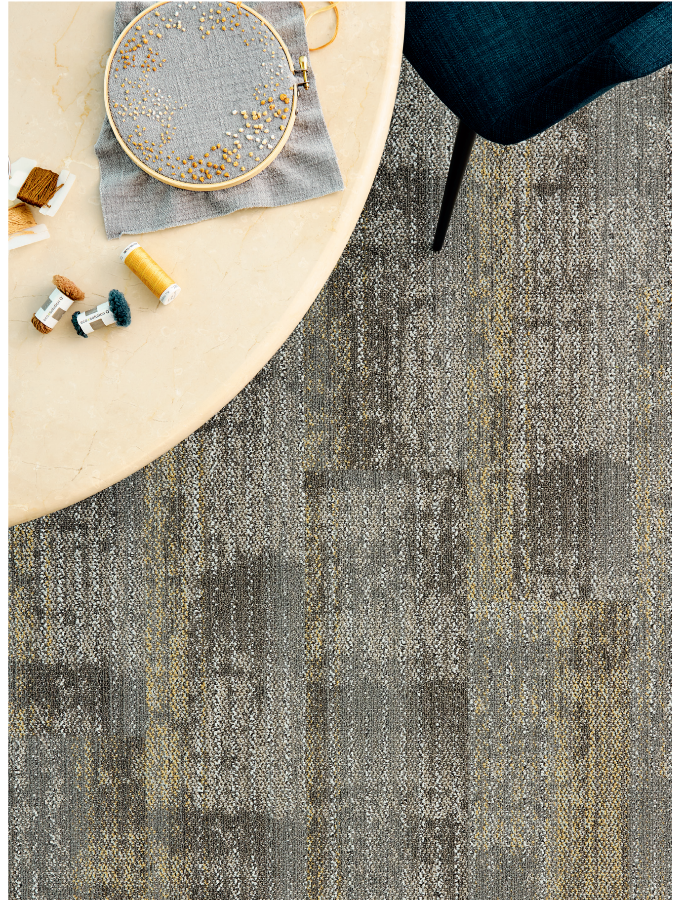
FRENCH KNOT (CARPET TILE 5T517) IN VINTAGE GOLD (16762) | INSTALLED STAGGER

This medium-scale pattern is influenced by the craft of French knot embroidery. French knot stitches are arranged to allow the pattern to organically flow from tile to tile. French Knot is a No Rules carpet tile: install in any configuration, mix dye lots, and replace as needed over time.