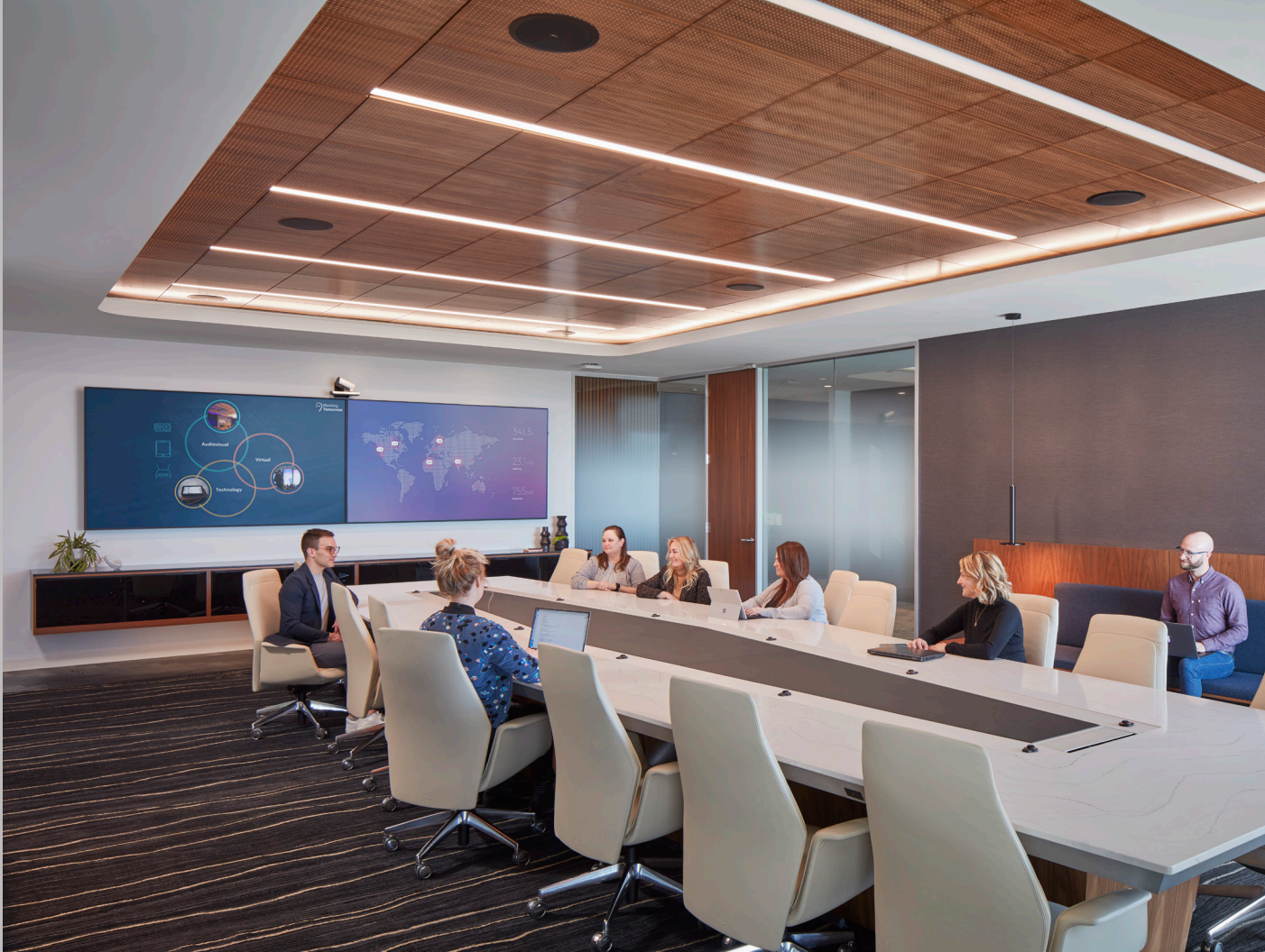
Horizon Therapeutics Deerfield, Illinois, USA by Lamar Johnson Collaborative FAULT (BROADLOOM 5A221) IN ONYX SILVER (20505)