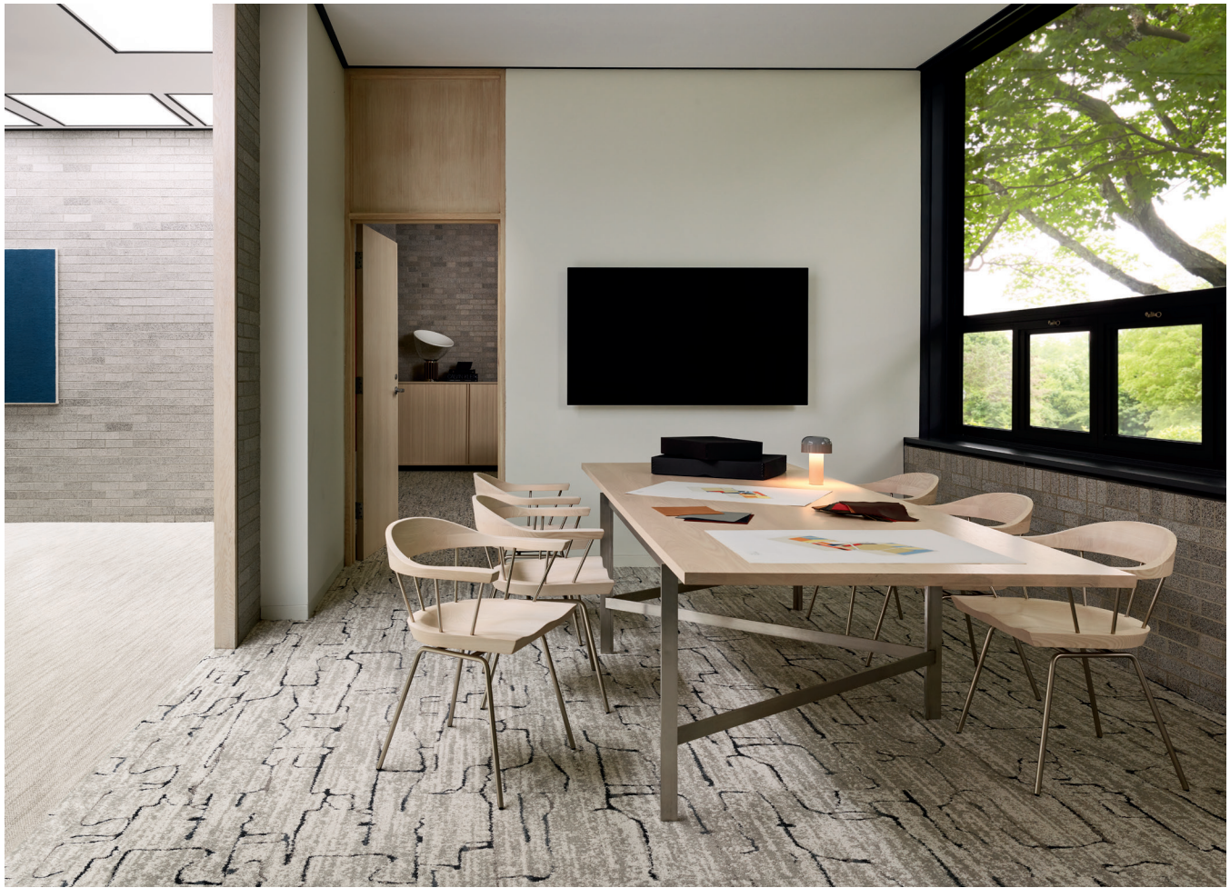
PROCESS TILE (GX302) AND HEDDLE TILE (GX320) IN ARGAN (01100) ON ECOLOGIX CUSHION BACKING