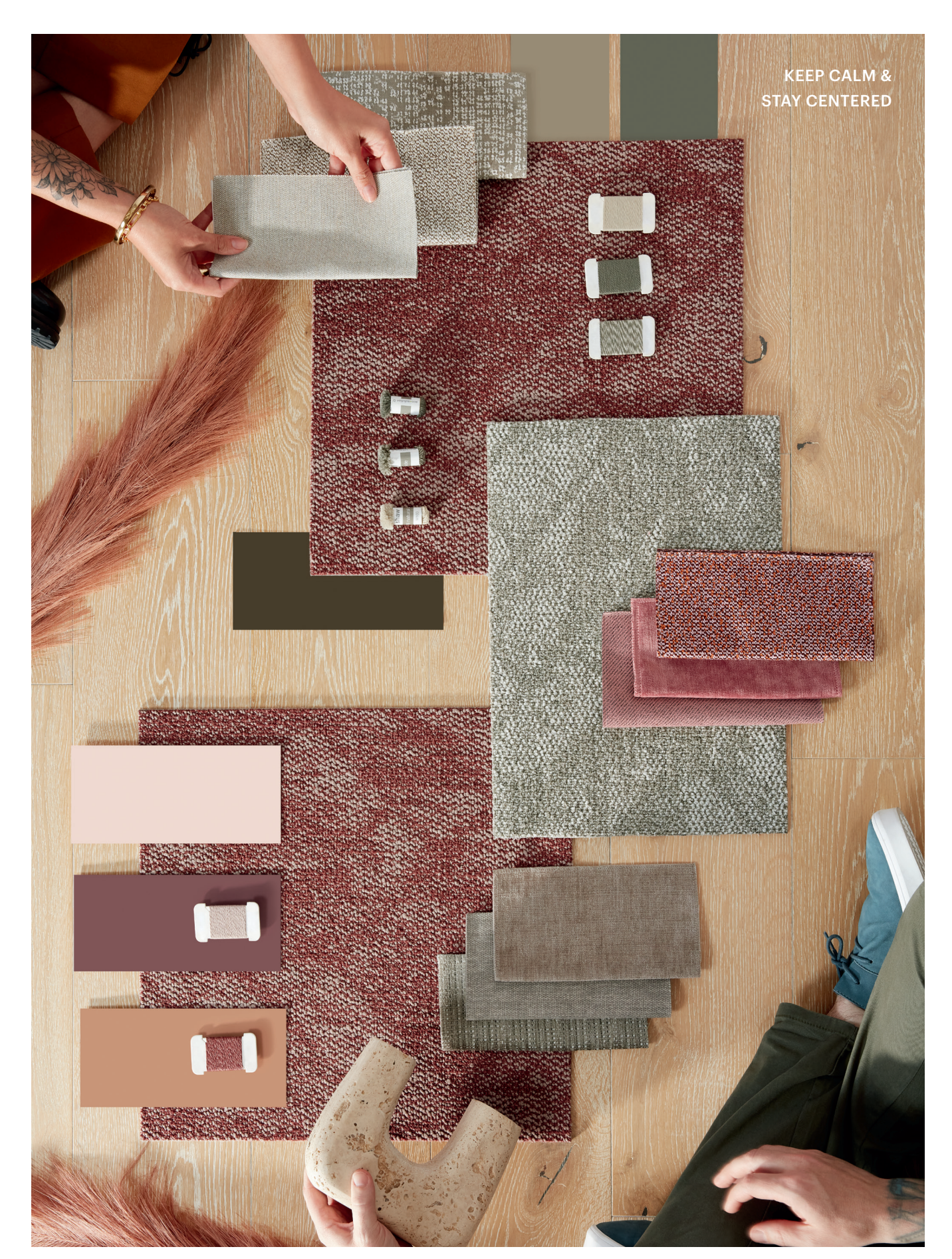
UPBEAT (CARPET TILE 5T490) IN CHEEKY (90870) + BUBBLY (90100)