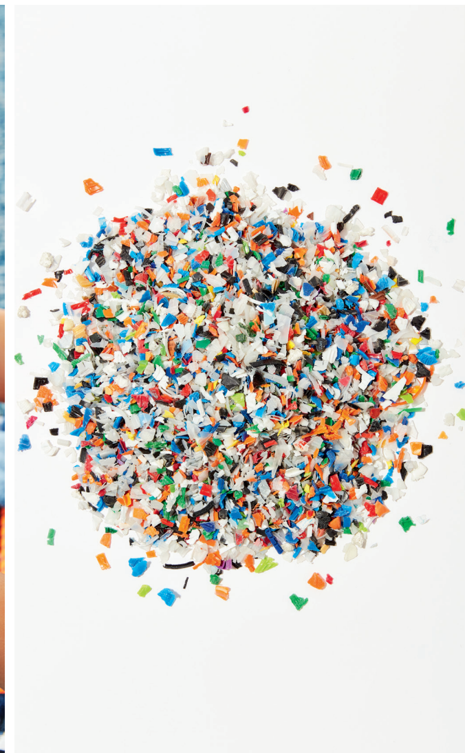
STITCHED TILE + PET FLAKE + STAPLE FIBER = A HAPPY LITTLE HUMAN