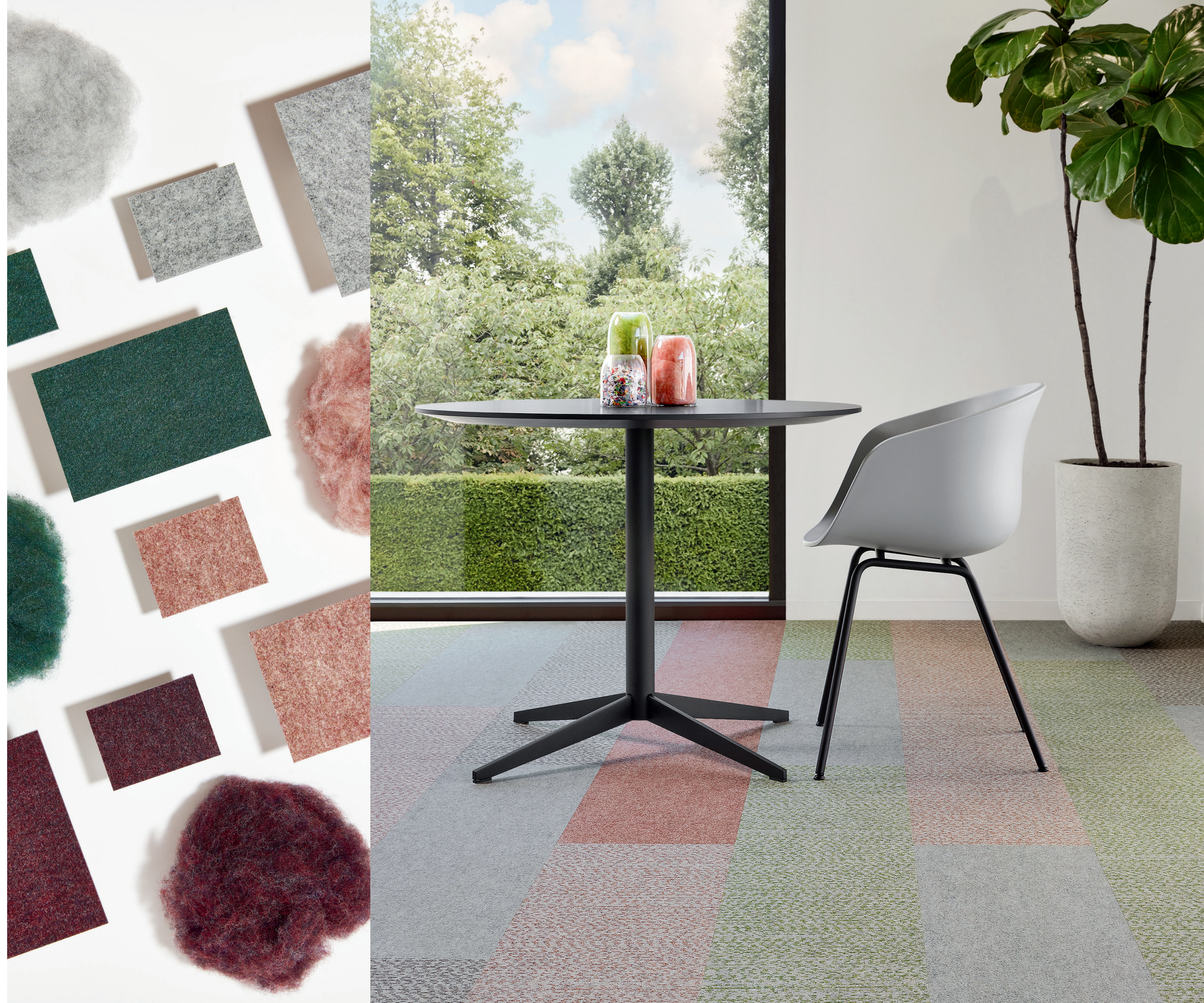
STAPLE FIBER + FELTED TILE

RIGHT: FELTED (REWORX™ TILE 5T455) IN VELVETEEN (55665) + PARCHMENT (55100) AND STITCHED (REWORX™ TILE 5T456) IN VELOUR STITCH (56667) + VERDURE STITCH (56328) + TWILL STITCH (56762) | BRICK