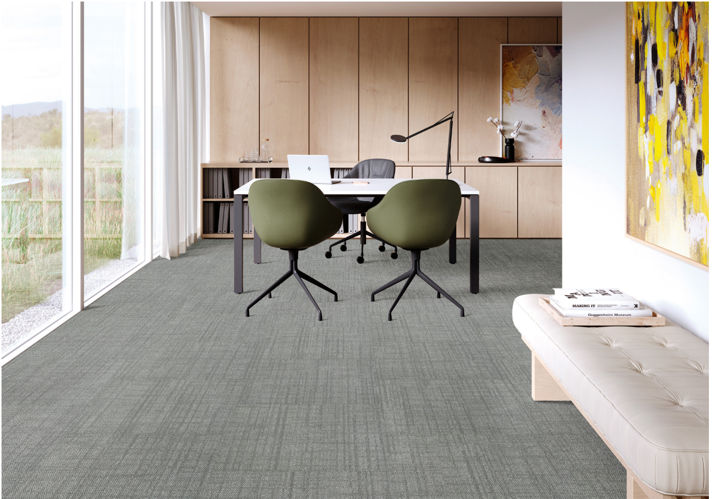
SURROUND (CARPET TILE 5T432) IN LIMESTONE (17530) | INSTALLED MONOLITHIC