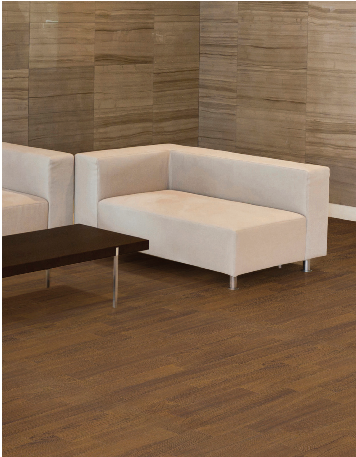
NATURELIFE WOOD II (0002V) IN VINTAGE HICKORY (09635)