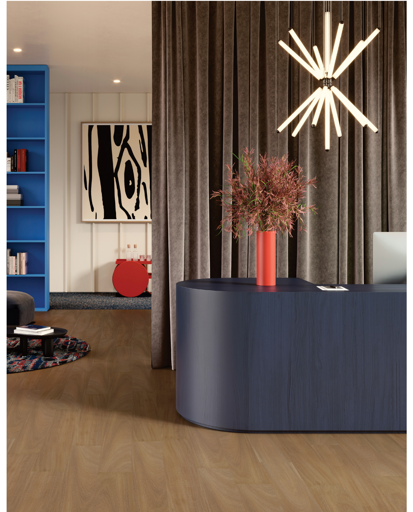
BRANCHING OUT (LVT 4256V) IN ZION OAK (56103) INSTALLED STAGGER AND DRIP (RUG G204R) IN VIBRANT (72585)

Branching Out 5mm LVT 20 mil | 5 mm 4256V