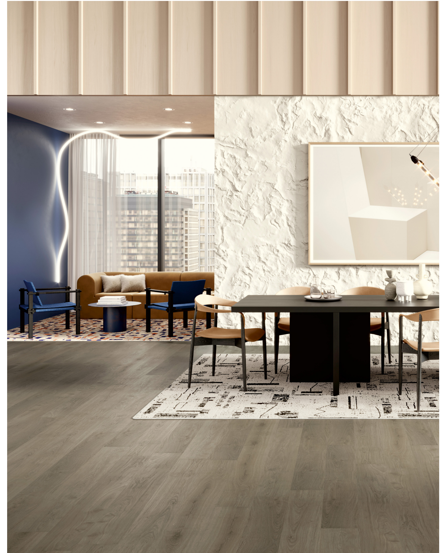
BRANCHING OUT (CORETEC 4309V) IN SMOKY OAK (56516) | INSTALLED STAGGER AND EMBRACE (RUG G001R) IN TRADITION (01105) AND SHARE (RUG G004R) IN EMPATHY (01100)

All COREtec® products that have a wear layer of 20 mil and up are recommended for light traffic levels when installed in a floating method and recommended for moderate traffic levels when installed in a direct glue method.