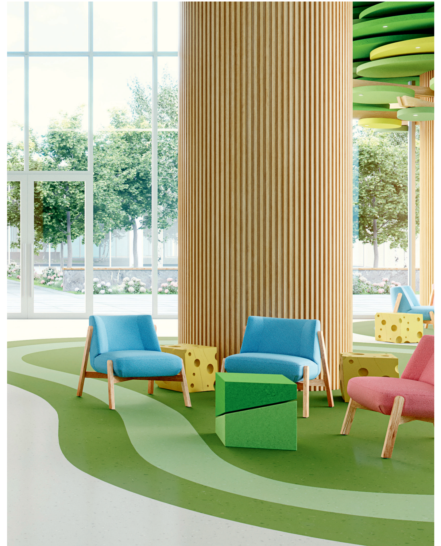
VITALITY HUES (4376V HOMOGENEOUS SHEET) IN EXCEL (00330), VERVE (00326), VIGOR (00325)