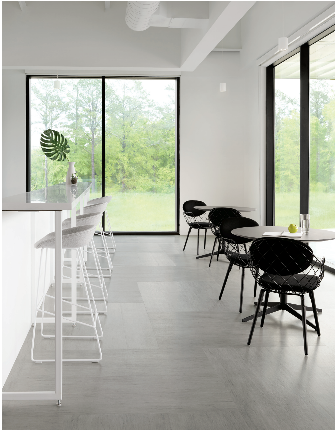
COVE (0927V) IN GESSO (27520)