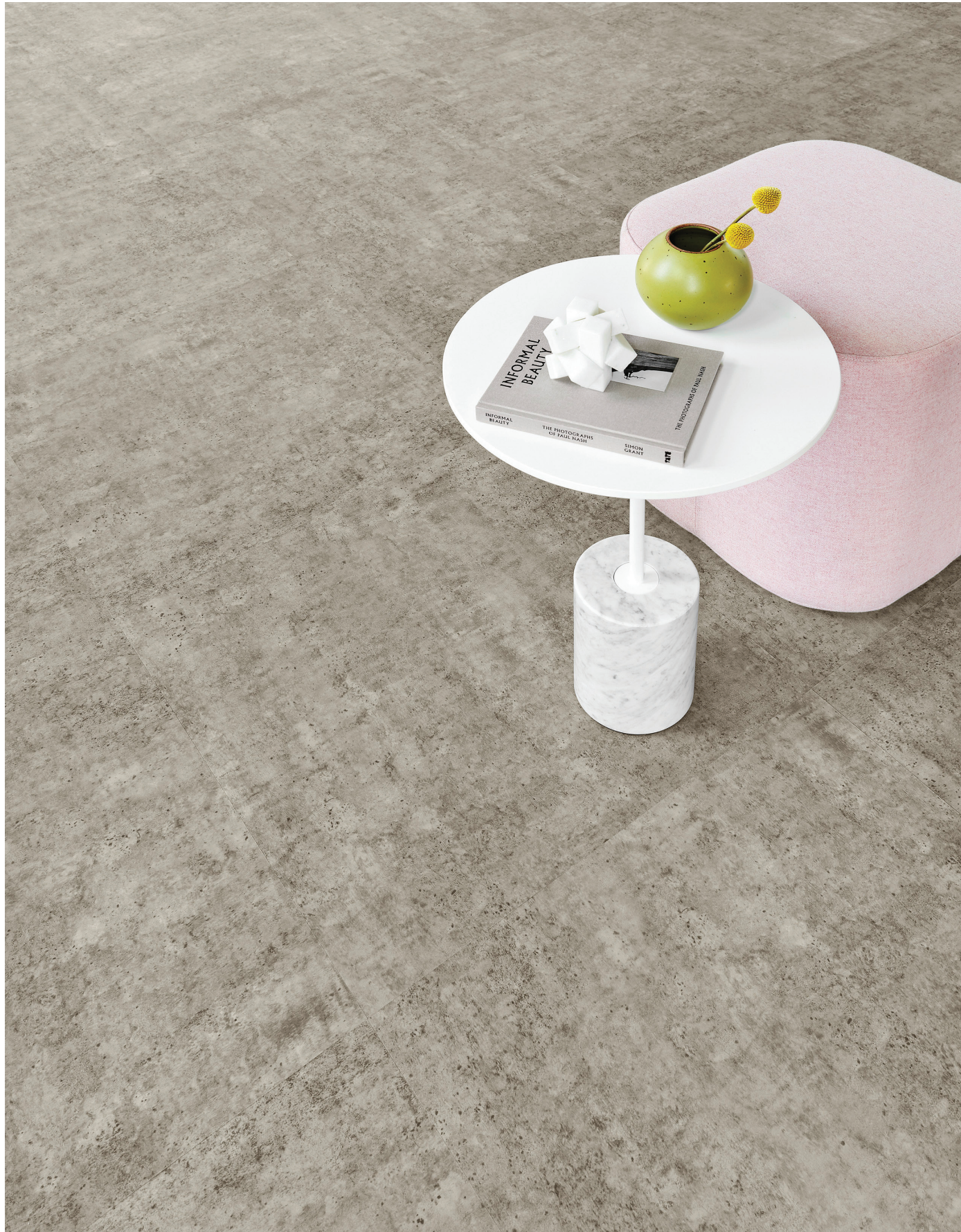
COMPOUND (4074V OR 4077V) IN BASE (77504)