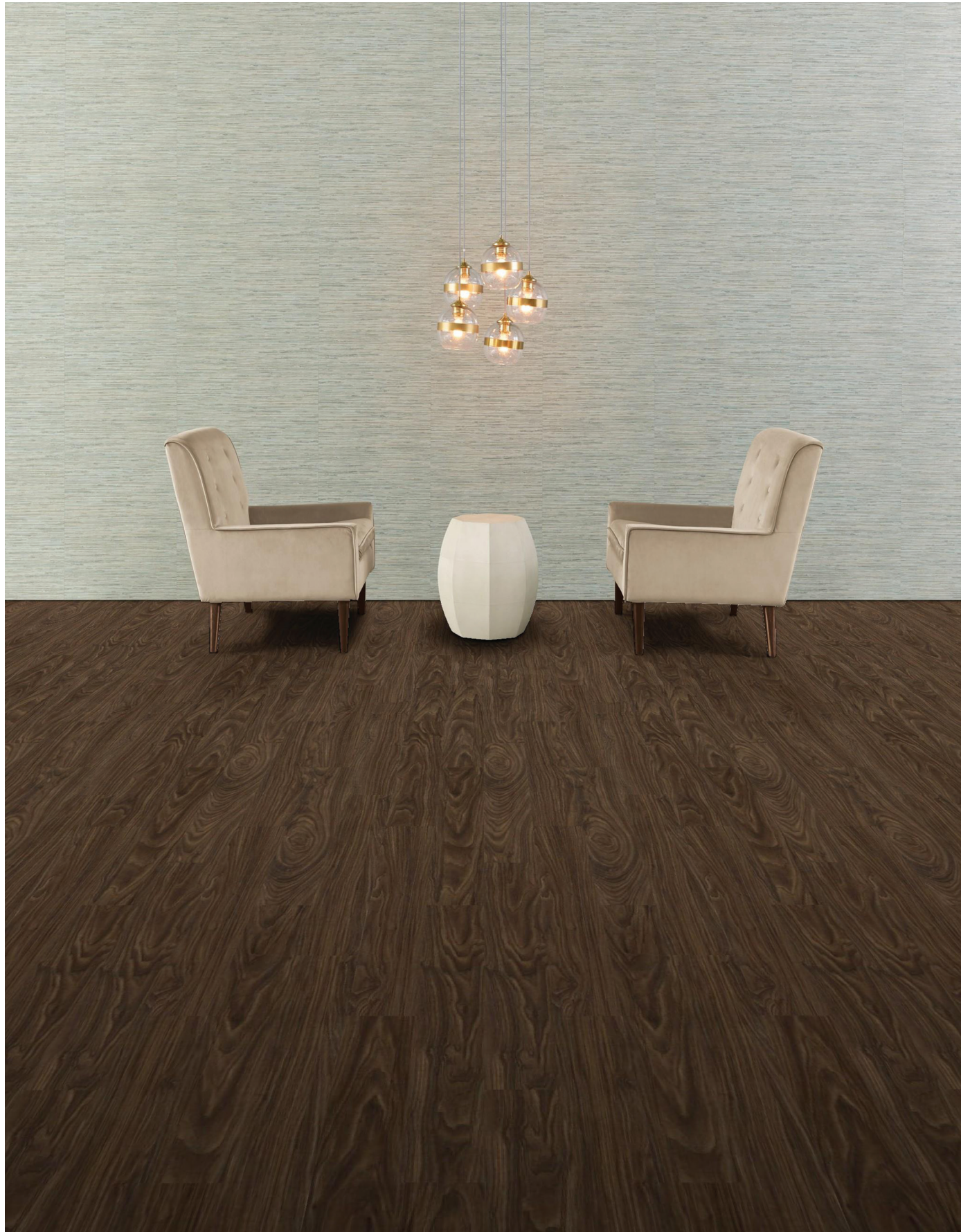
STRATUM 500 (023UV) IN TARGHEE WALNUT (00503)