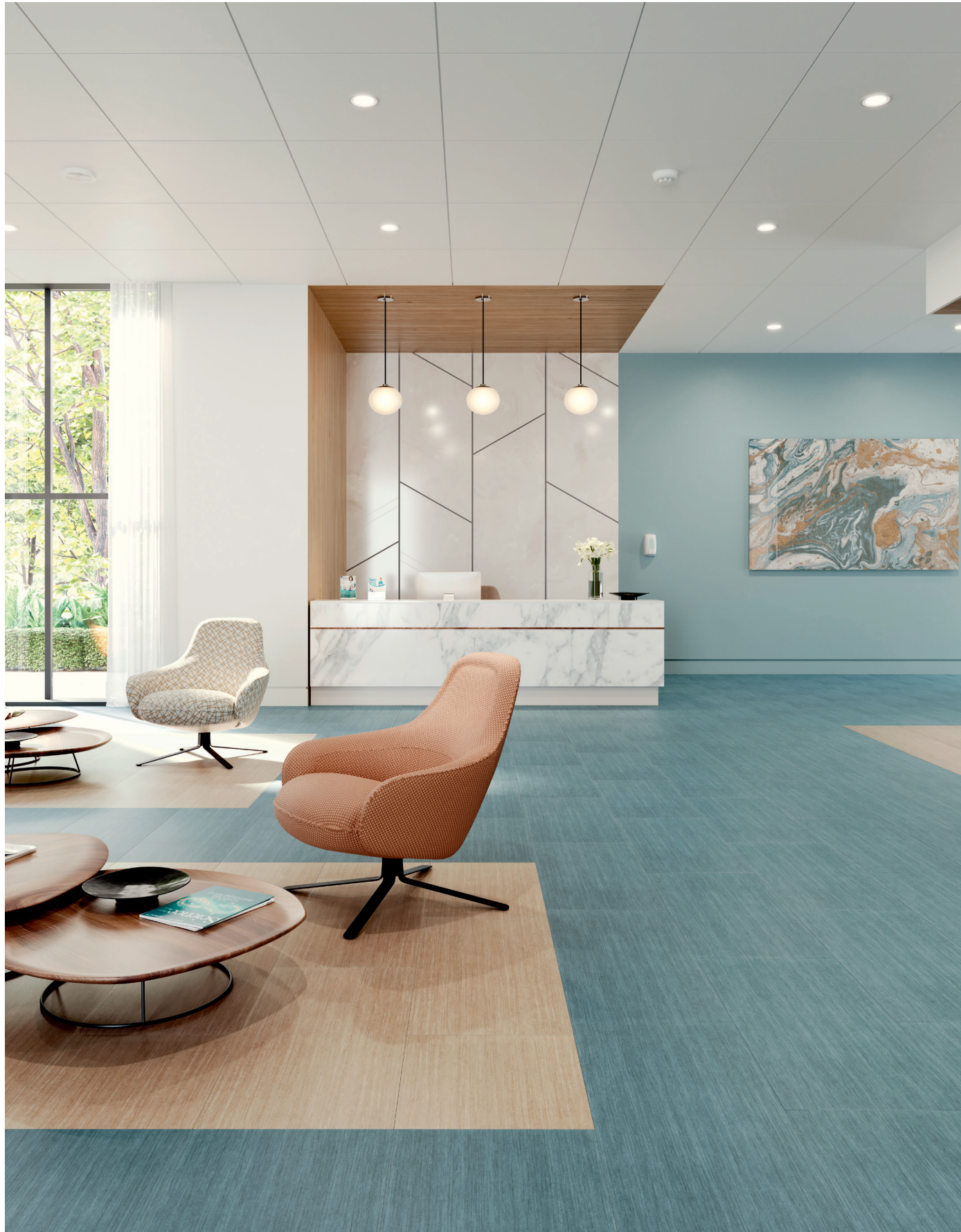
INNATE STRIA (RESILIENT TILE 4367V) IN OCEAN (67416), DUNE (67105), CLAY (67130) | INSTALLED STAGGER