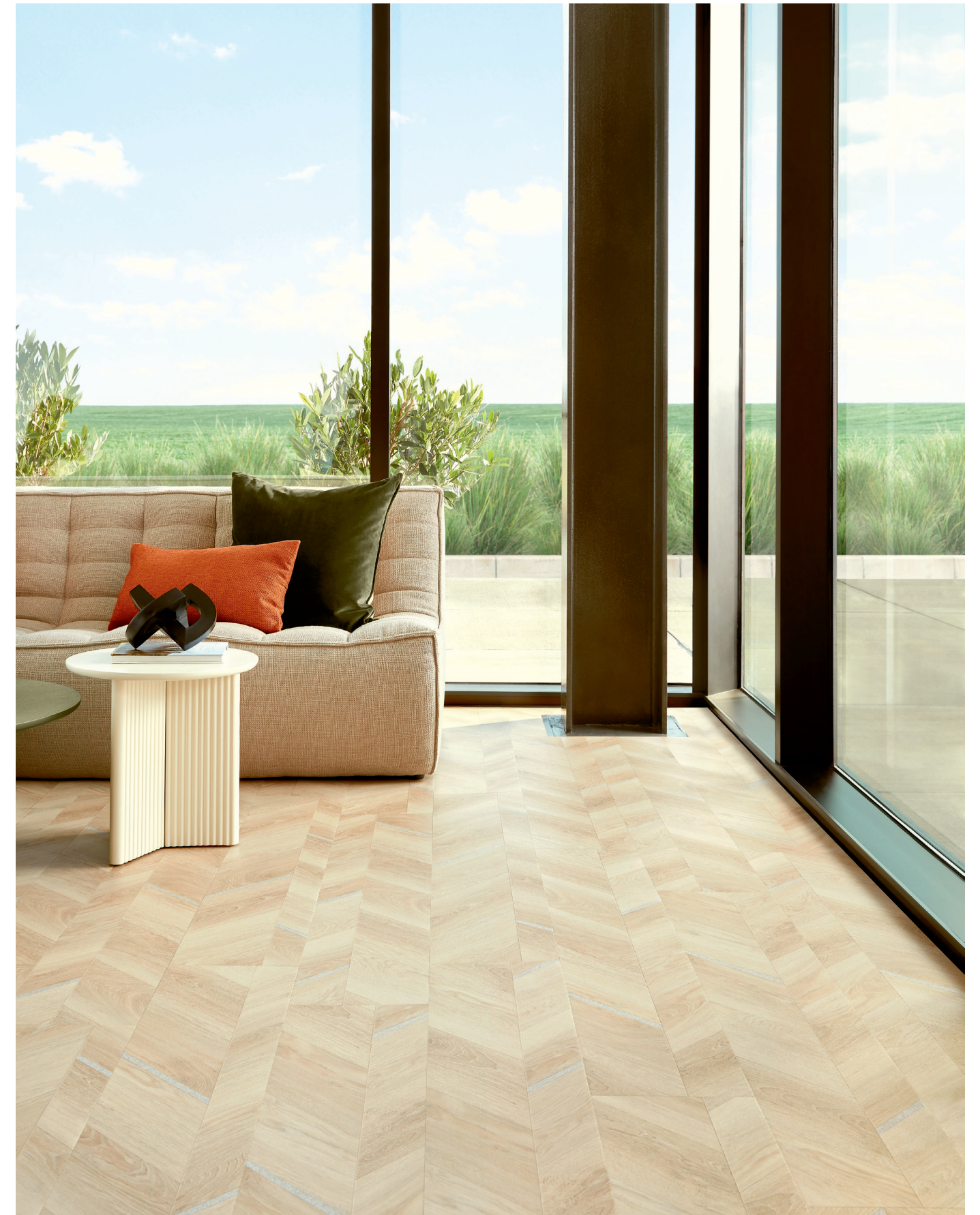
UNION (LVT 4349V) IN CONCRETE SPINDLE (49140) | INSTALLED STAGGER