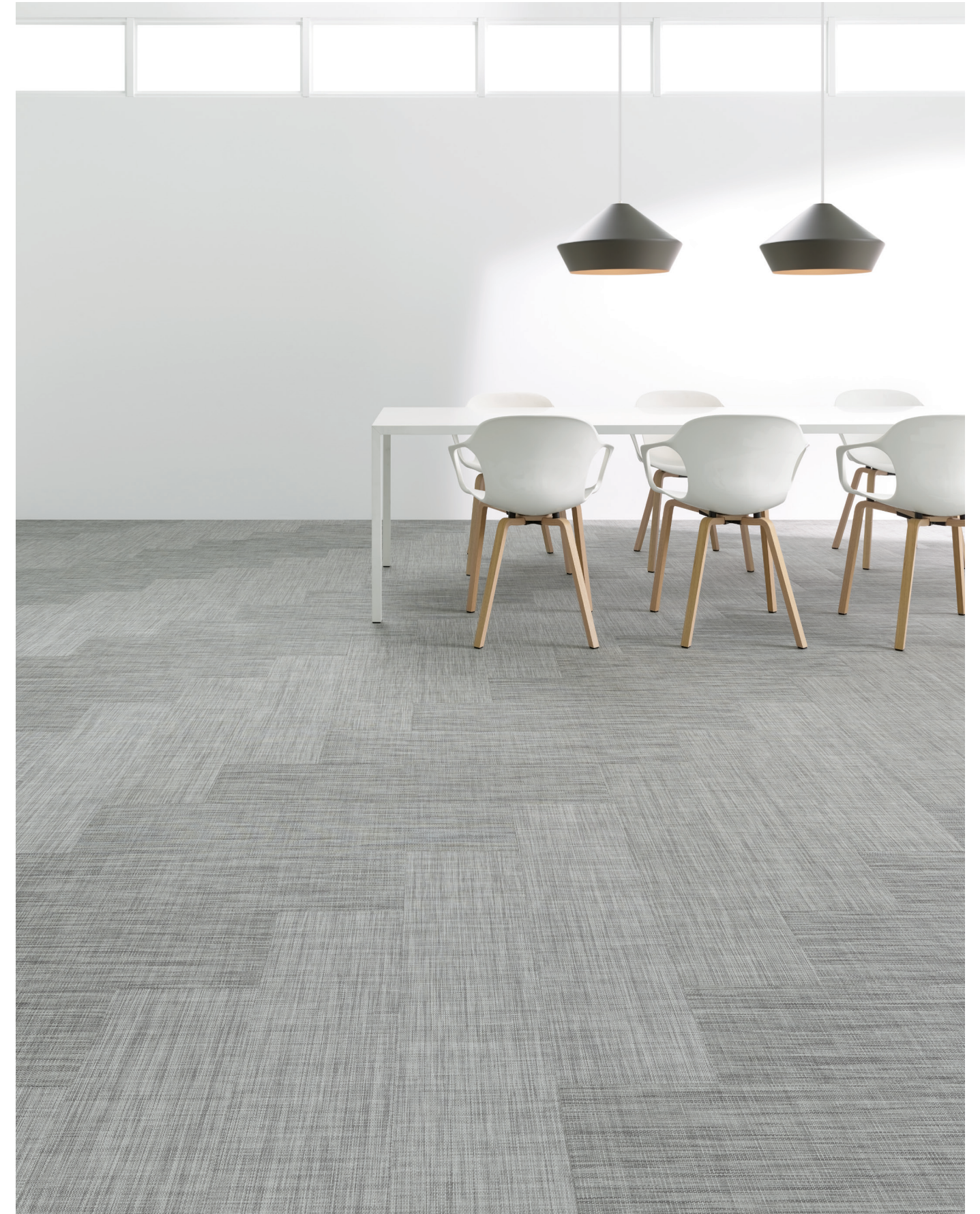
RETHINK (0733V) IN CARBON (33505)