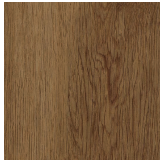
For sample, order BS762 color 90740.